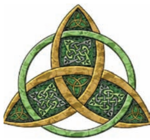
The Holy Trinity